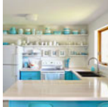
Before and After: A Colorful Budget-Friendly Kitchen Update