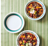
Pumpkin Soup Recipes