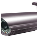
Limited Offer: Install & Activate ADT Pulse Free! ADT Sponsored