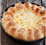
Super Bowl Dips That Will Be Gone by Halftime