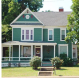
50 Houses Under $50,000